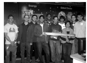
MISA partners with UC Santa Cruz ISMA for the LLNL Tour

As you know, the Spring Semester is well underway, and we are very excited to have you join us at our many upcoming events. Upcoming events include our Halo tournament, paintball, software workshops, and Company Tours. UC Santa Cruz (UCSC) Information Systems Management Association (ISMA) will be joining us for a second